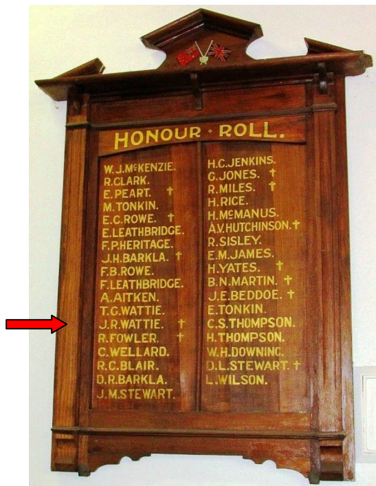
Newstead Methodist Church Honour Roll