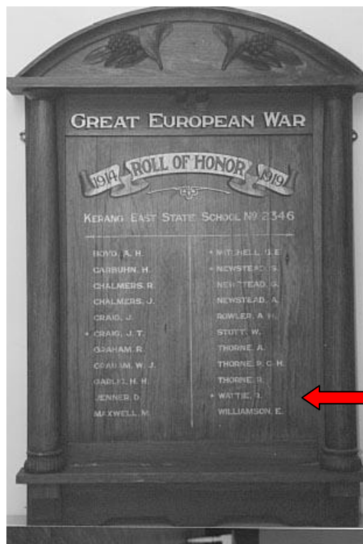
Kerang East State School Honour Roll