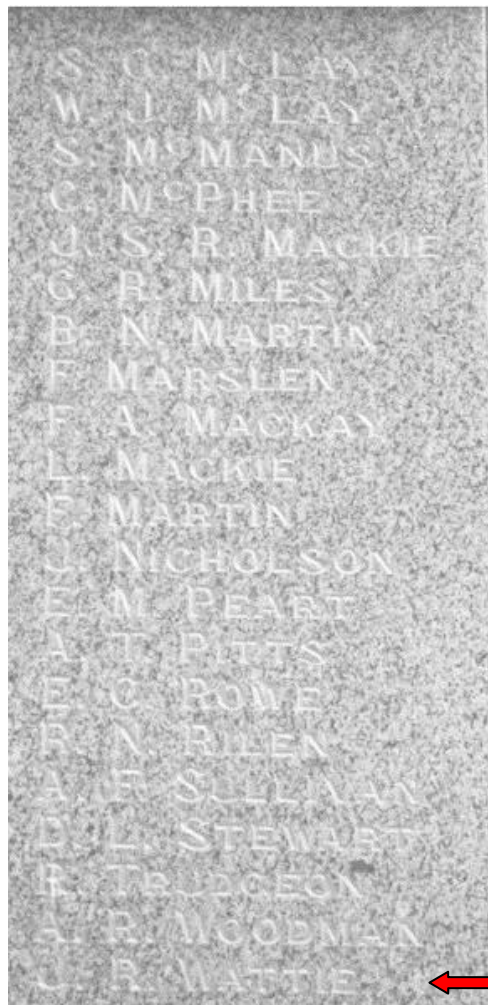
Newstead War Memorial