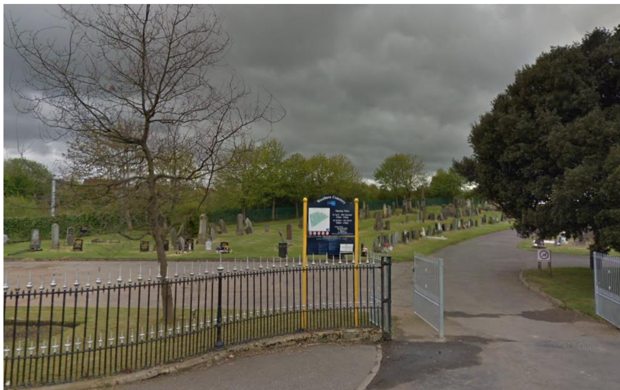
Entrance to Westburn Cemetery, Cambuslang, Glasgow

Westburn Cemetery, Cambuslang, Glasgow contains 60 Commonwealth War Graves – 22 from World War 1 & 38 from World War 2.