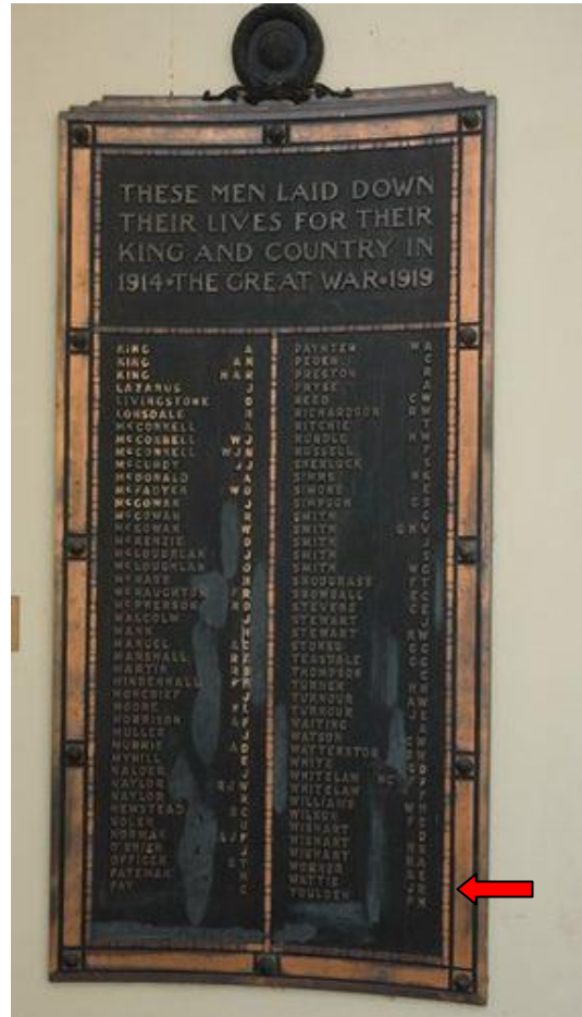
Kerang Shire Honour Roll