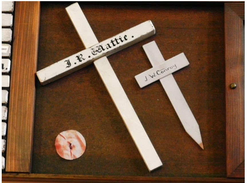
Newstead Avenue of Honour