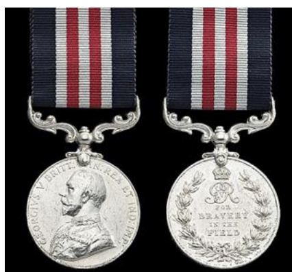
Military Medal issued for bravery in battle on land.

(War Diary information from the Australian War Memorial)