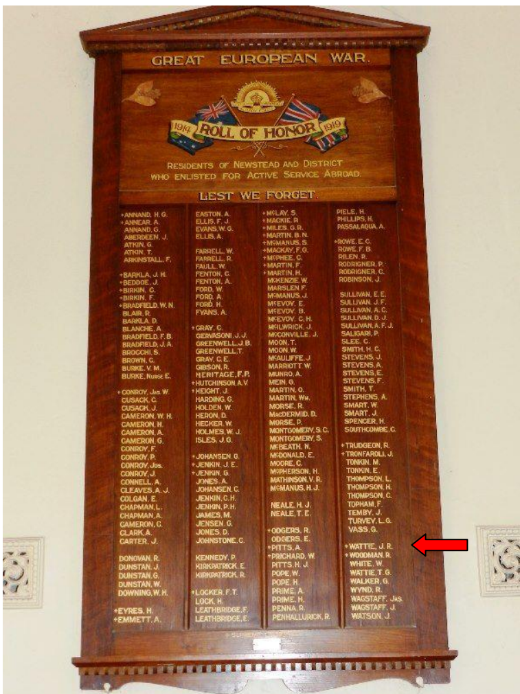
Newstead & District Honour Roll